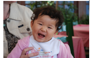
Enjoying Team Retreat